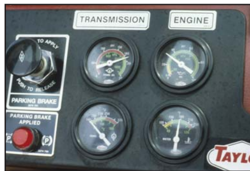
Conveniently mounted gauges and systems warning lights and controls