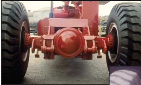
TLS-1000 drive axle