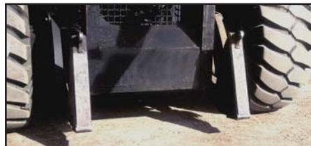
Optional log pushers to improve log stacking