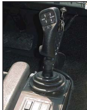
Joystick fingertip hydraulic and electric remote controls for smooth precise control